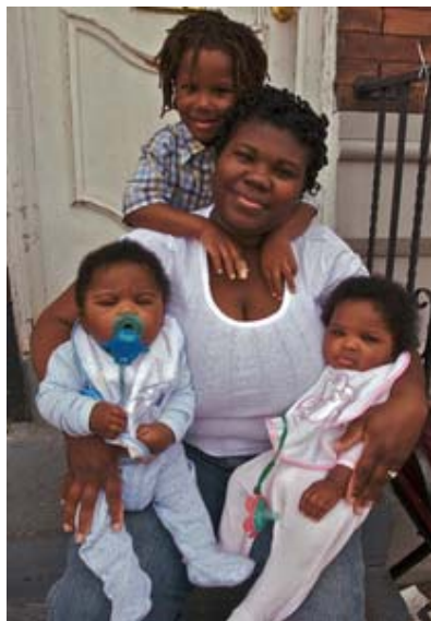
Philadelphia Inquirer, May 6, 2008

It's high time that women who experience household food insecurity speak out, and become involved. GROW is launching a new participatory study. Women will have Canon PowerShot digital cameras to document their lives and tell policy makers and the public the real story from their own points of view.