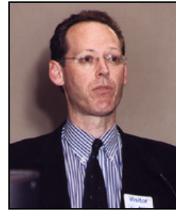
Paul Farmer