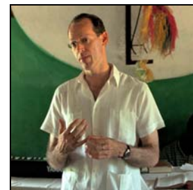
Paul Farmer

Dr. Farmer founded Partners in Health, an international nonprofit organization that provides direct health care, research and advocacy for those who are sick and living in poverty – particularly in Haiti, Russia and Peru. He also pioneered innovative, community-based treatment for AIDS and tuberculosis. Dr. Farmer proved to the world that it is possible to deliver quality healthcare in poor, rural settings. In 2003, his work was profiled in Tracy Kidder's book Mountains Beyond Mountains: The Quest of Dr. Paul Farmer, A Man Who Would Cure the World .