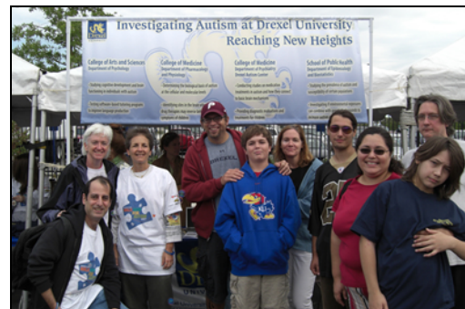
SPH Faculty, Staff and Families at Autism Walk